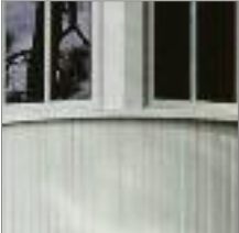
Trimboards, Sheets, Corners, Beadboard, Brickmould, Drip Cap and more...

Restoration Millwork® cellular PVC trim makes an authentic statement on your home. Available in smooth and realistic woodgrain TrueTexture™ finish in a wide variety of traditional and specialty profiles – you can also mill it or paint it to create custom designs.