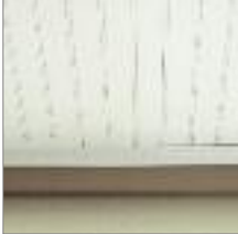
Beaded Triple 2" Panel with Soffit Cove Molding