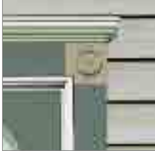
3-1/2" Lineal with Crown Molding, Corner Block and Rosette