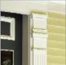
Window & Door Casings, Panels, Detailed Millwork and Special J-Pocket Accessories for Vinyl Siding