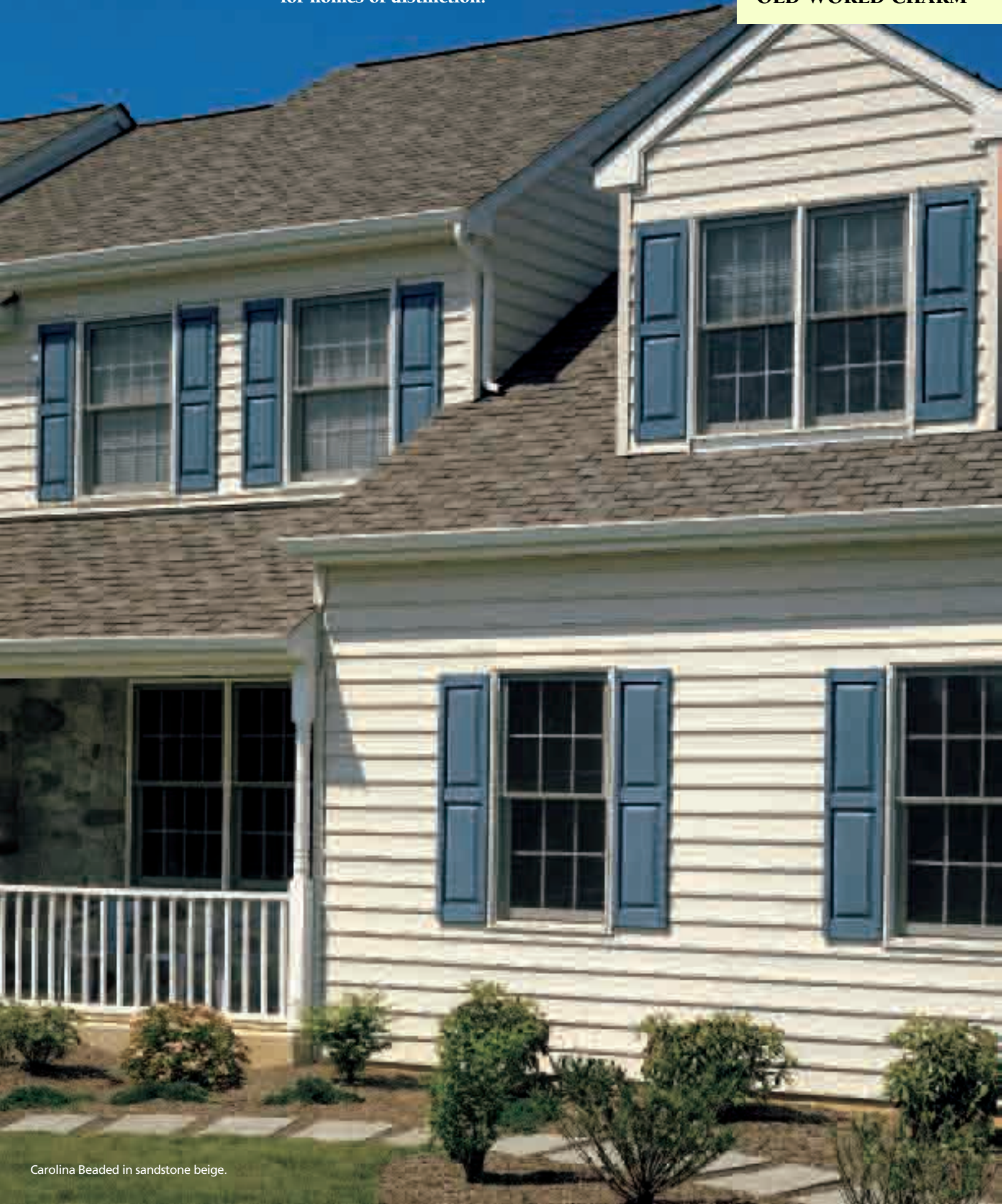
Carolina Beaded in sandstone beige.

UNIQUE STYLE FOR TRADITIONAL, OLD WORLD CHARM