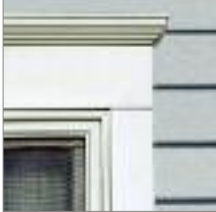
5" Lineal with Crown Molding