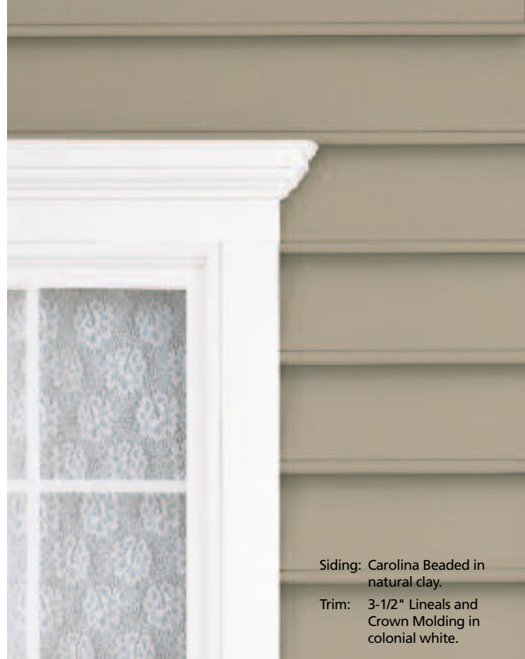
Siding: Carolina Beaded in natural clay. Trim: 3-1/2" Lineals and Crown Molding in colonial white.