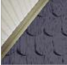
Cornice Molding with Cedar Impressions Half-Round accents and Vinyl Carpentry Triple 2" Beaded Soffit