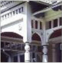
Column enclosures, Soffit, Fascia or Custom Milled Designs